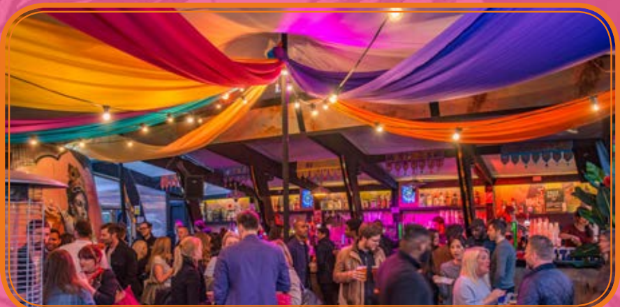
Main Dance Floor

With an overall capacity for 500 guests and three semi-private areas suitable for groups of 30 up to 150 guests, Magic is sure to have a space that is just right for your party.